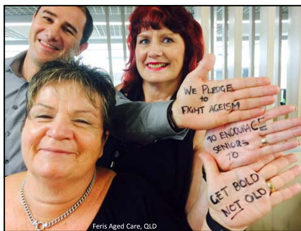
Feris Aged Care, QLD