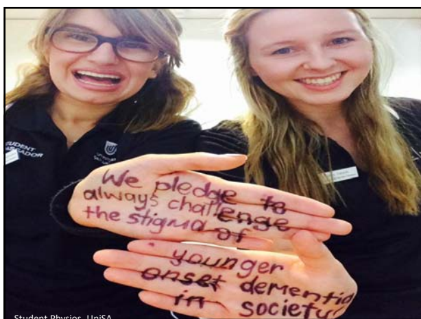
Student Division, UniSA